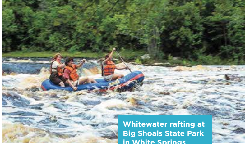
Whitewater rafting at Big Shoals State Park in White Springs