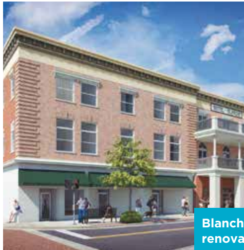
Blanche Hotel renovation rendering

Spanning 13 counties, North Central offers activities for every age and interest. Fish the scenic Withlacoochee and Suwannee rivers or snorkel for scallops along the Gulf of Mexico shore. Hike Ocala National Forest, browse Cedar Key's quaint shops or see Florida wildlife aboard a glass bottom boat at Ocala's iconic Silver Springs. In Gainesville, browse the Florida Museum of Natural History and the Samuel P. Harn Museum of Art (general admission is free); visit the Santa Fe College Teaching Zoo, the only zookeeper training facility with its own accredited zoo; or join the crowds at "Spirit of the Suwannee Music Park" in Live Oak for camping, recreational activities and outdoor music festivals — 600,000 visit this venue annually.